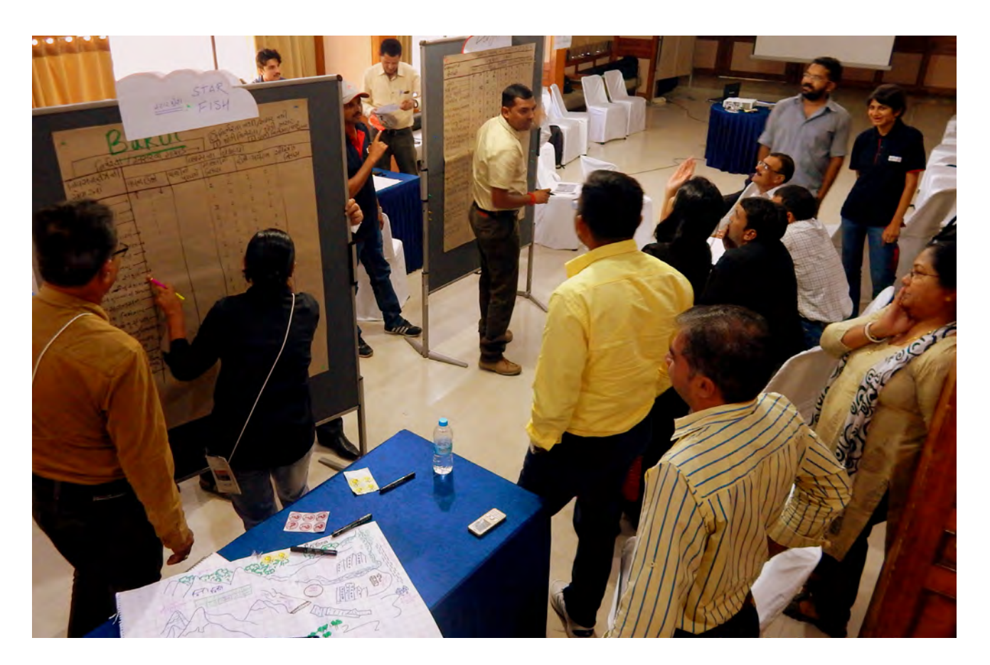
"A truly participatory training, where the participants get ample amount of time and situations to express themselves"

Majority of the participants developed a plan to conduct awareness and training sessions, November 2016 onwards, on coastal and marine biodiversity for their colleagues and staff.