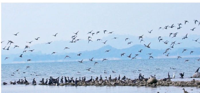
Pong Dam wetland