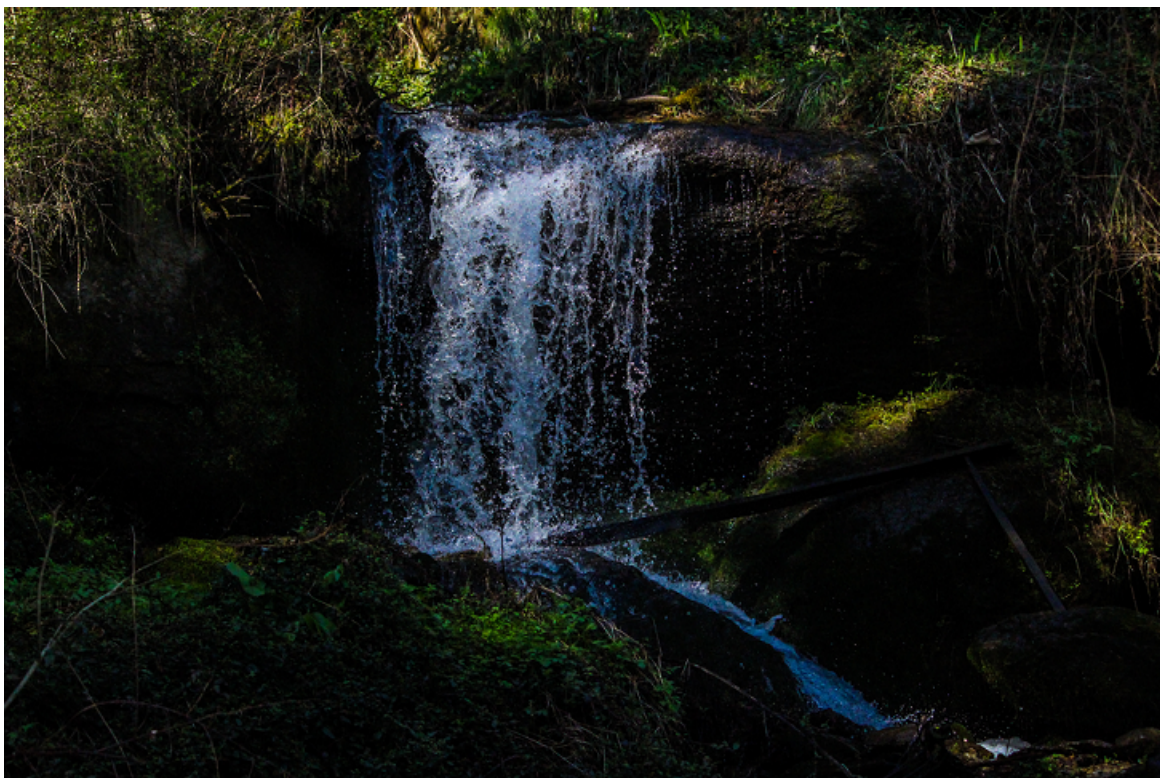
Waterfall at Shangarh, Himachal Pradesh