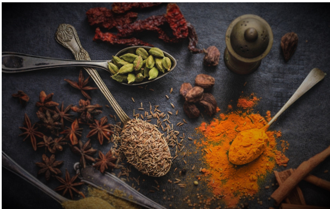
The project focuses on 3 spices: Cardamom, Cumin and Turmeric