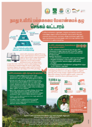
Know Your BMC (Tamil) Factsheets