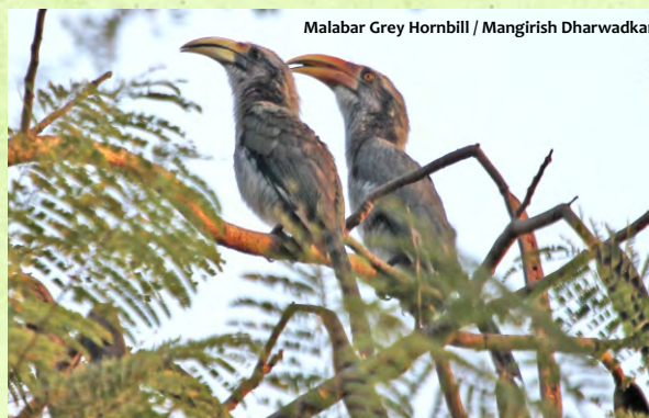
Malabar Grey Hornbill / Mangirish Dharwadkar

Registration of participants : Online Registration fees : Rs.2500/- [includes festival kit, breakfast & lunch for first 2 days, except accomodation], Non-refundable. Payment mode :Online Payment gateway Number of participants : 200 Schedule of Registration : 15th September 2016 onwards. Registration shall close once the number of delegates reach 200.