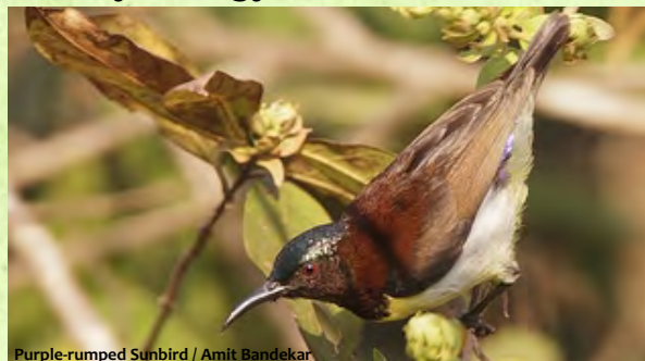
Purple-rumped Sunbird

Department of Tourism, Paryatan Bhavan, Patto, Panaji, Goa Phone : 0832-2494203; Fax - 0832-2494204 Email : dirgoatourism@gmail.com