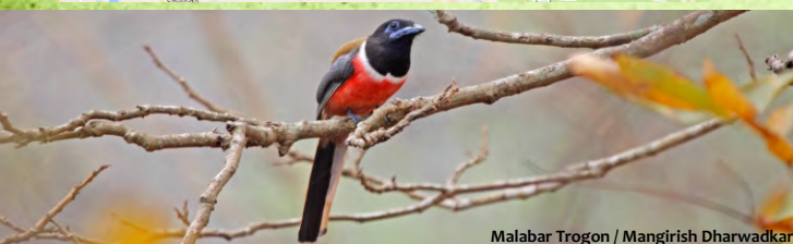
Malabar Trogon