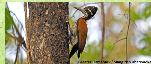
Greater Flameback / Mangirish Dharwadkar

Participants : Amateur photographers residing in State of Goa. Theme : "Birds of Goa". No. of entries : Up to two entries / individual. Conditions : The photographs must be taken during 1st September up to 15th October. Entry fee : Nil. Submission : Copies of the photographs in colour of the size 8"x10" along with soft copies of minimum 1024 pixels on long side to be furnished to Goa Forest Department and GBCN respectively. Contact : Forest Department or GBCN Prizes : Best three entries shall be awarded cash prizes.