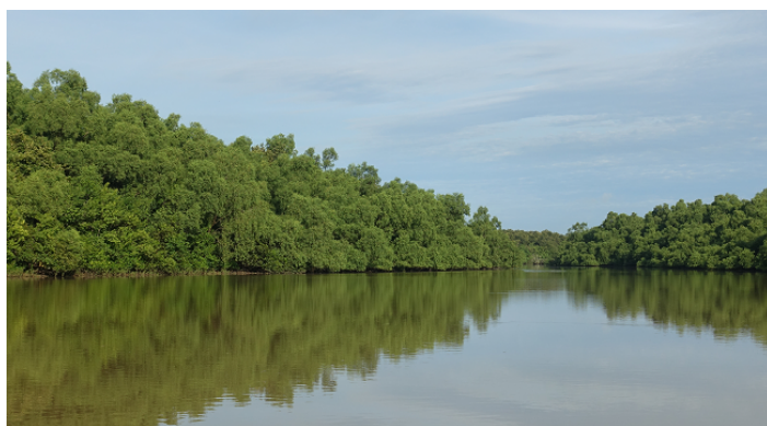
Bhitarkanika Mangroves in Odisha