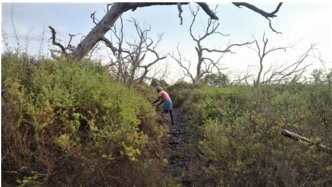
Fishing canal prior to restoration